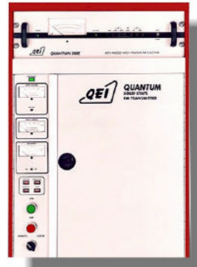
QUANTUM-Series Control Group

Subcarrier Amplitude Response: .....+/-0.2 dB, 40 kHz to 100 kHz